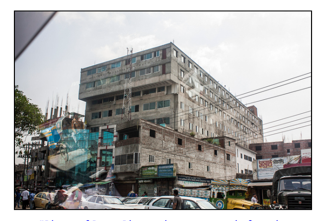
<u>"Photo of Rana Plaza taken one year before the collapse"</u>

The incident shook Bangladesh's $28 billion garment industry, the second largest in the world behind China. It drew attention to horrific conditions for