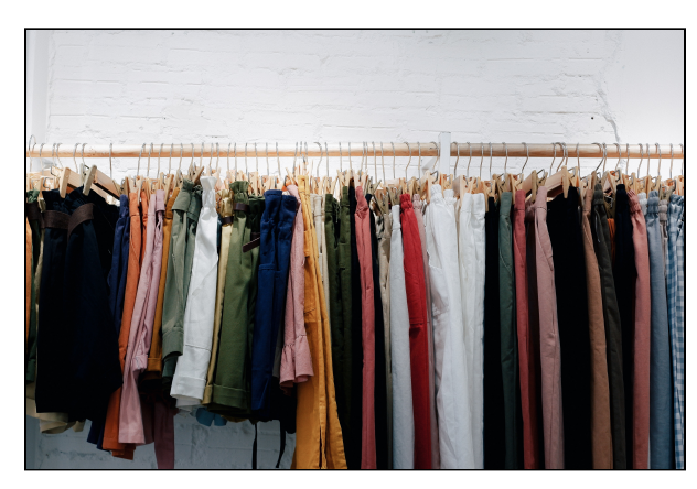
"A colorful line" by Duy Hoang is licensed under CCO.

Just a week or two later, these same jackets will be labeled fall's hottest back-to-school item, selling to teens for $14.99 each at malls across the United States.